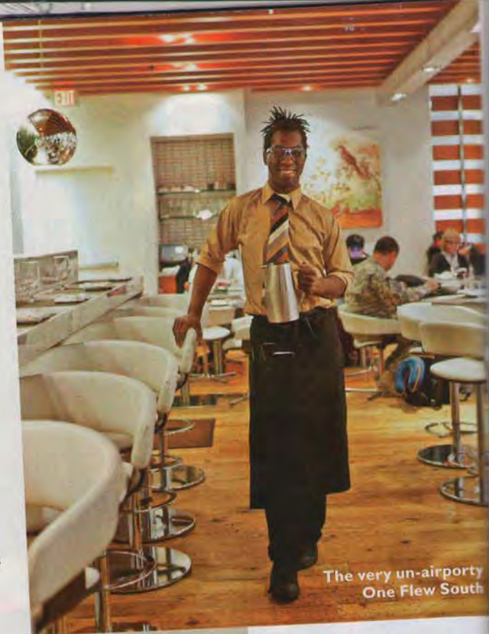
The very un-airporty One Flew South